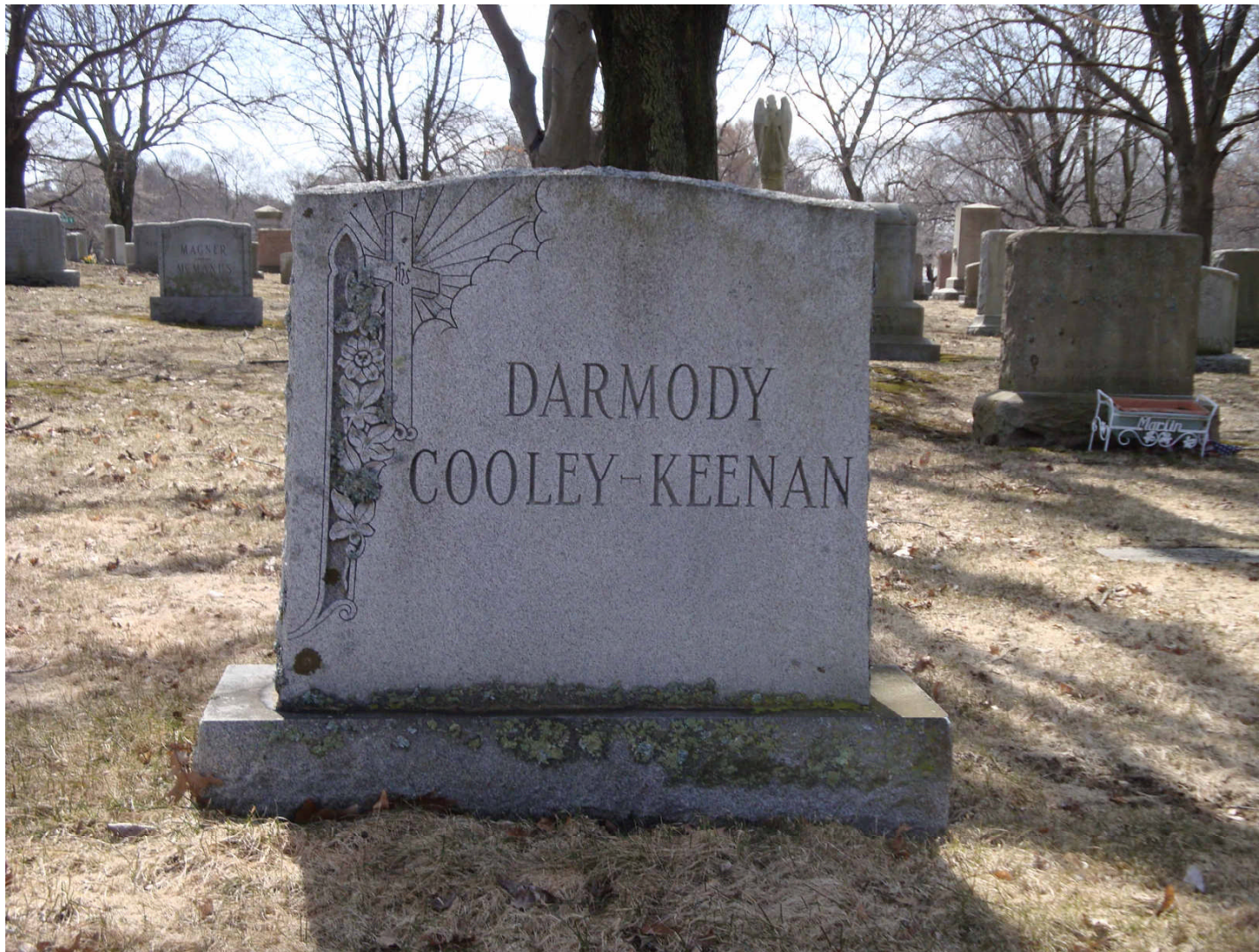
Avenue 17, Lot 220. Between St. Joseph's and St. Michaels