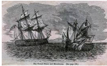
Battle of the US and the Macedonian from Thirty Years Before the Mast