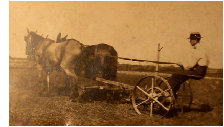
Man plowing in Fairmont, WV late 1800s