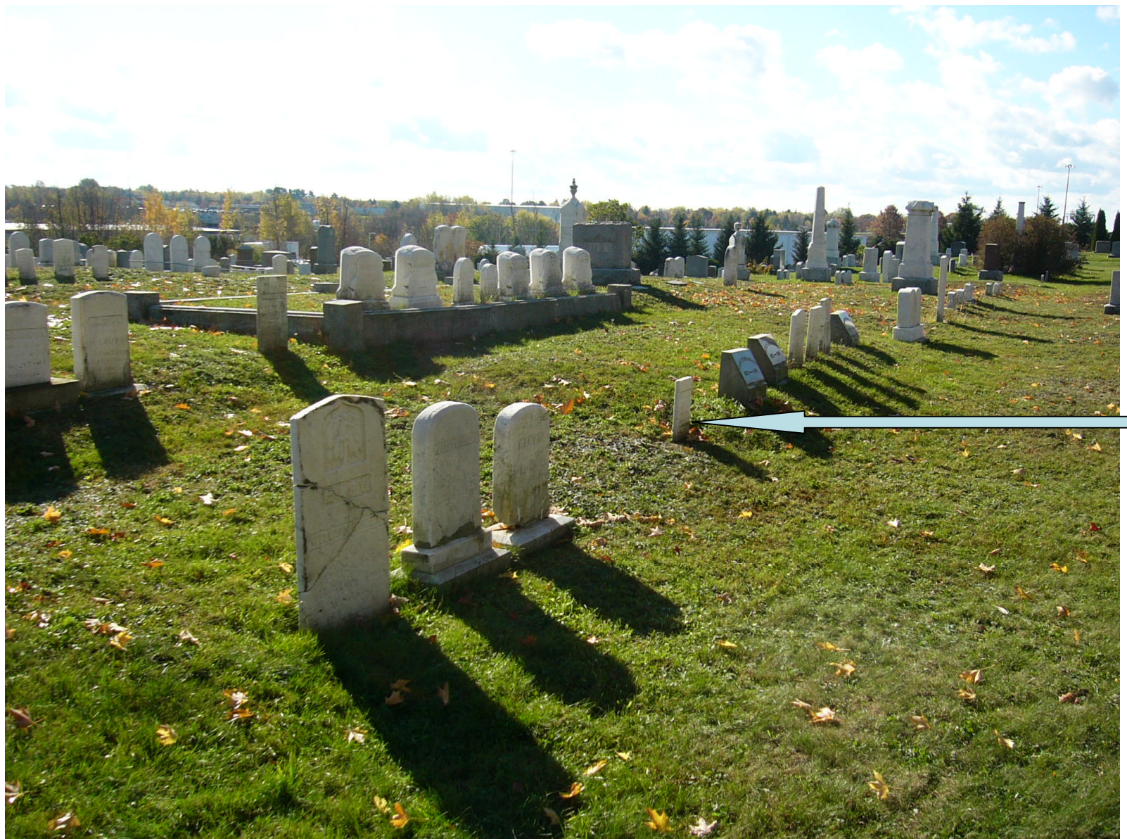
View of the 3 Rogers' stones in front, showing gap between them And Sarah, the next stone on the right. Arrow points to Sarah.