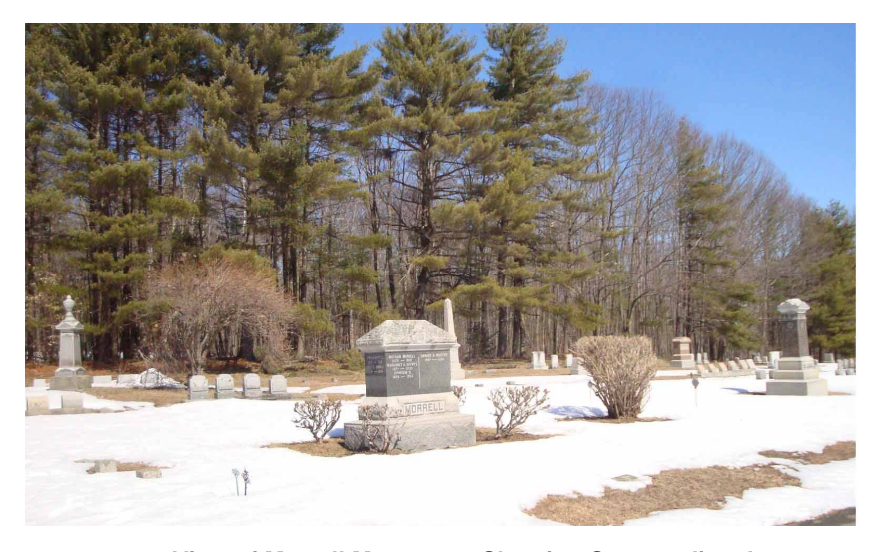
View of Morrell Monument Showing Surrounding Area